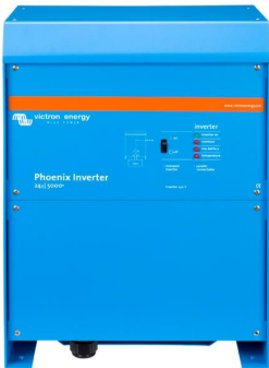
Phoenix Inverter 24/5000