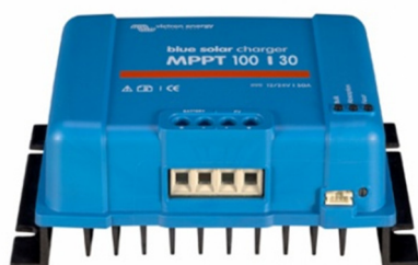
Solar charge controller MPPT 100/30